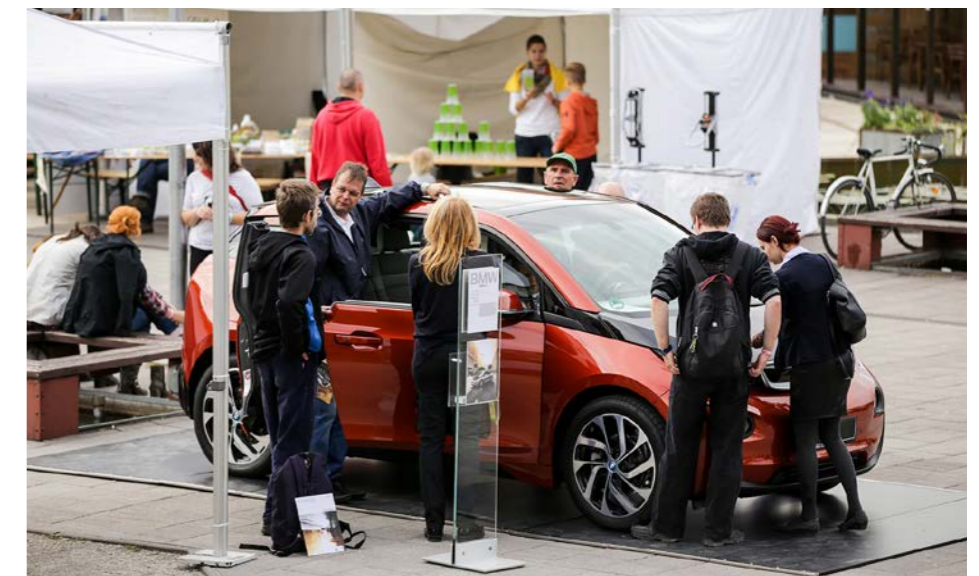
BMWi3 at the Sustainability Day

The +1 section meeting in the afternoon looked back at the past and into the mirror of the present, but most of all it was about the future, our common future, which is of interest to all of us.