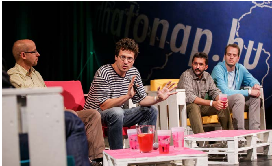
Participants of the environment section at the 7th Sustainability Day